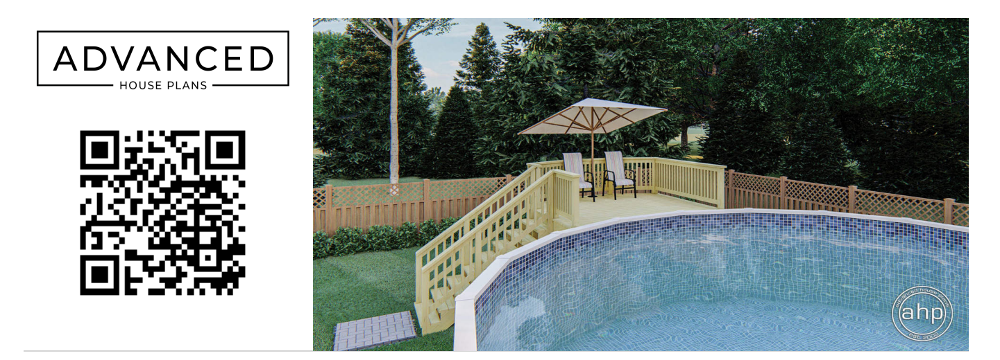
30079 - Palisade Data Sheet