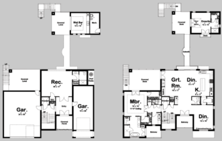
THIRD LEVEL ARTWORK ON NEXT PAGE

MAIN LEVEL: 3040 SQ FT SECOND LEVEL: 2229 SQ FT THIRD LEVEL: 1107 SQ FT TOTAL FINISHED: 4376 SQ FT EXTERIOR DIMENSIONS 64' - 4" WIDE 83' - 4" DEEP